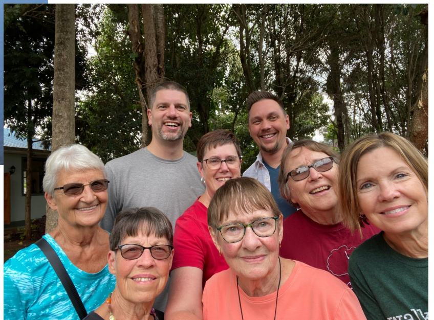
Right: A team of eight residents, team members and family members from Garden Spot Village spent 18 days in Nairobi on a Travel with Purpose Trip, learning about and serving with Missions of Hope International.